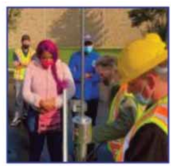
STUDENT APPRENTICESHIP/ INTERNSHIP PROGRAM