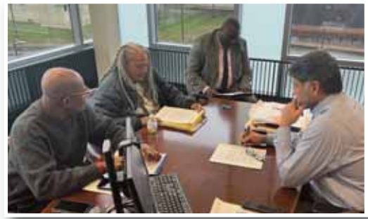
American Federation of Teachers Meeting