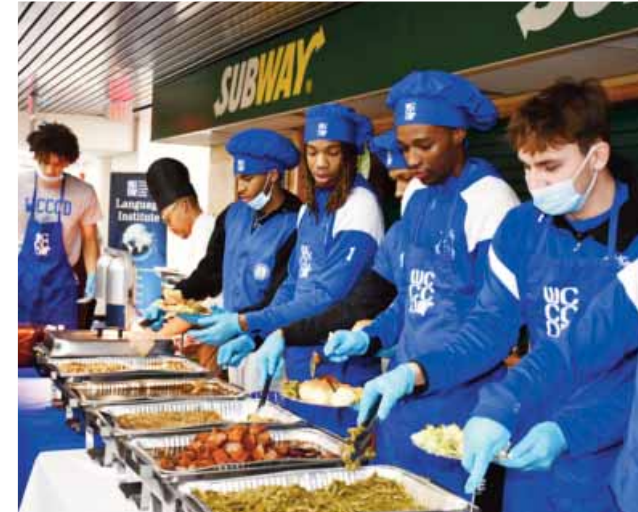
One Vision, One District, One College