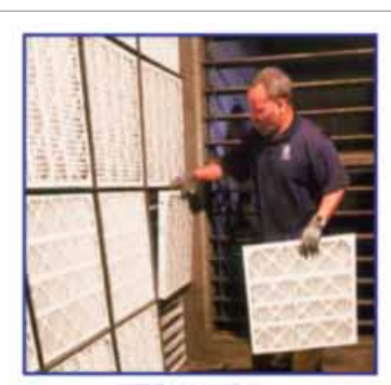
MECHANICAL SYSTEMS MAINTENANCE