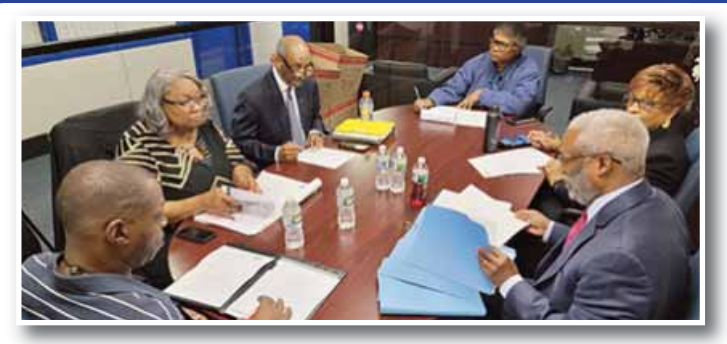
Monthly UAW Bargaining Meeting