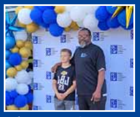
Eastern Campus Student Graduate Celebration

Students from the Detroit Public Schools Community District participated in a workshop about the importance of seeking ways to cope with emotional stress.