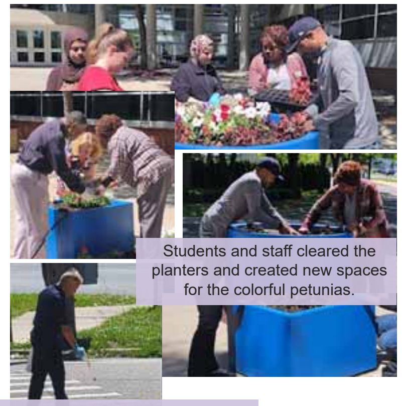
Facility staff sprayed the campus grounds for weed prevention.