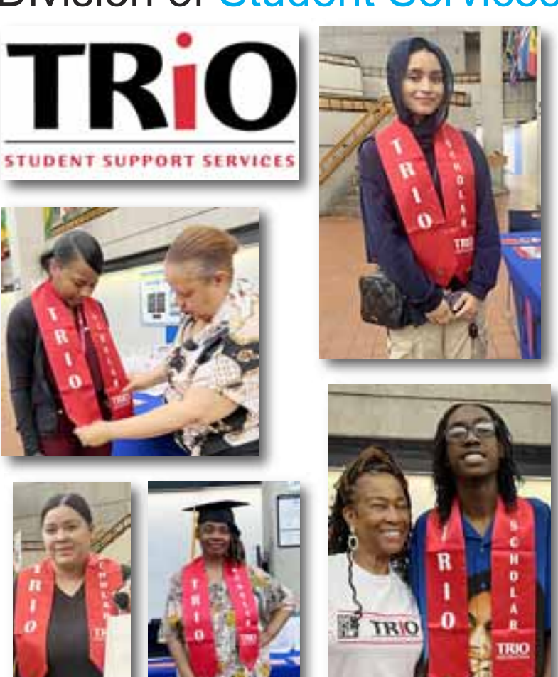
The Division of Student Services distributed TRiO Program stoles and goodie bags to graduating students.