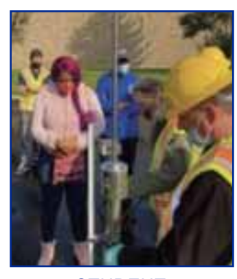
STUDENT APPRENTICESHIP/ INTERNSHIP PROGRAM