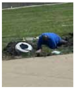
Facilities staff continue to make repairs throughout the Curtis L. Ivery Downtown Campus grounds.