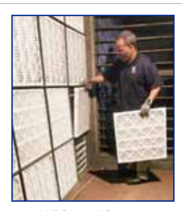
MECHANICAL SYSTEMS MAINTENANCE