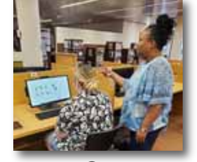
Learning Resource Center

Staff assisted students with online resources available to complete course assignments.