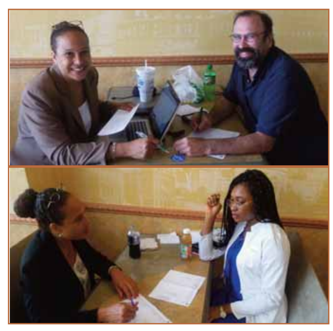
Student Executive Council members met to discuss upcoming events.