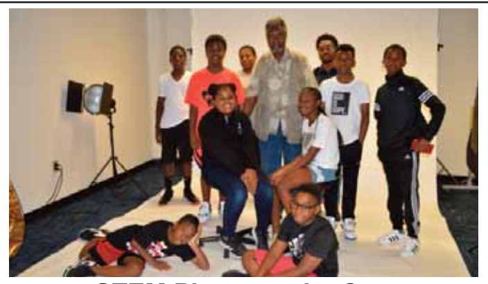
STEM Photography Camp