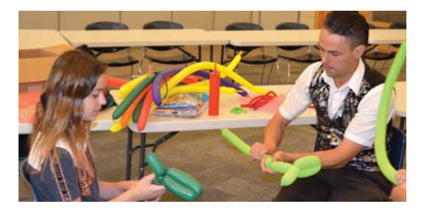
Juggling, Circus and Balloon Twisting Workshop. This two-hour workshop is for kid's ages 8 to 12 years old.