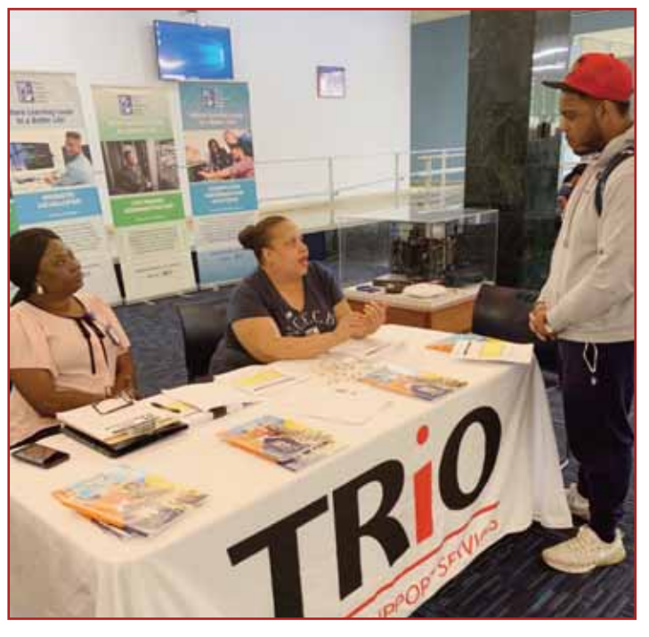
TRIO program staff provided information at the Northwest Campus.