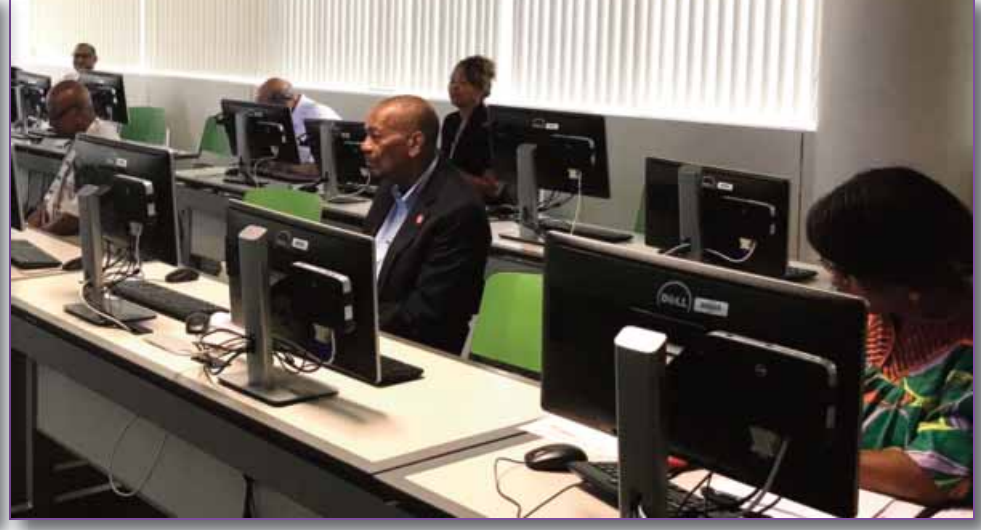
The Banner 9 Upgrade Implementation Team held a session with Educational Affairs and selected faculty focus group regarding the upcoming Banner 9 Faculty Self-Service (Webgate) Upgrade project.