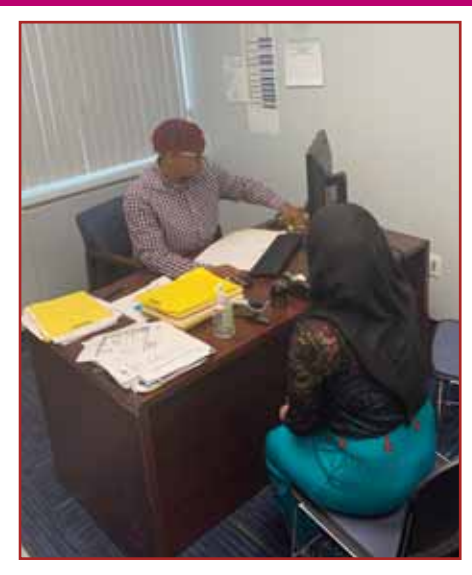
Student Services staff continues to support veteran students in preparation for fall classes.