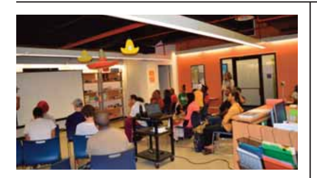
Global Language Series – French Culture