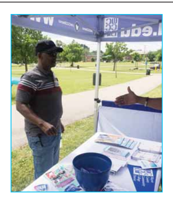
Detroit Soul Day Festival