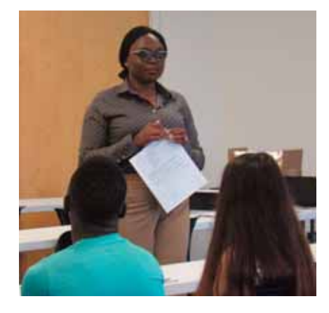
The College Readiness: Roadmap to Academic Success Workshop introduced to high school Early Middle College (EMC) and dual enrollment students to academic success in their college courses.