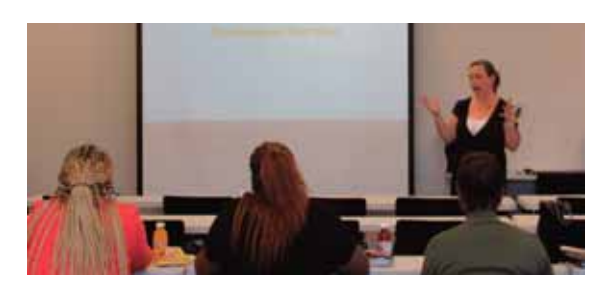
Hosted staff professional development: Critical Skills for Customer Service