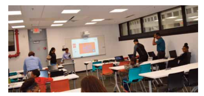
Cool Kids Coding Camp