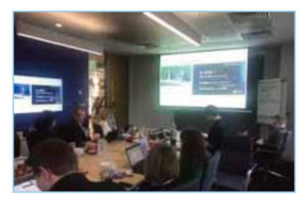
The HR team viewed a webinar on "A Data driven Approach to Sexual Violence Prevention Training (Title IX)."