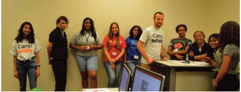
MCWT week-long Camp Infinity introduced girls to the field of technology.