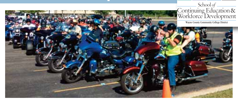
Hosted Taylor International Rotary Wounded American Ride.