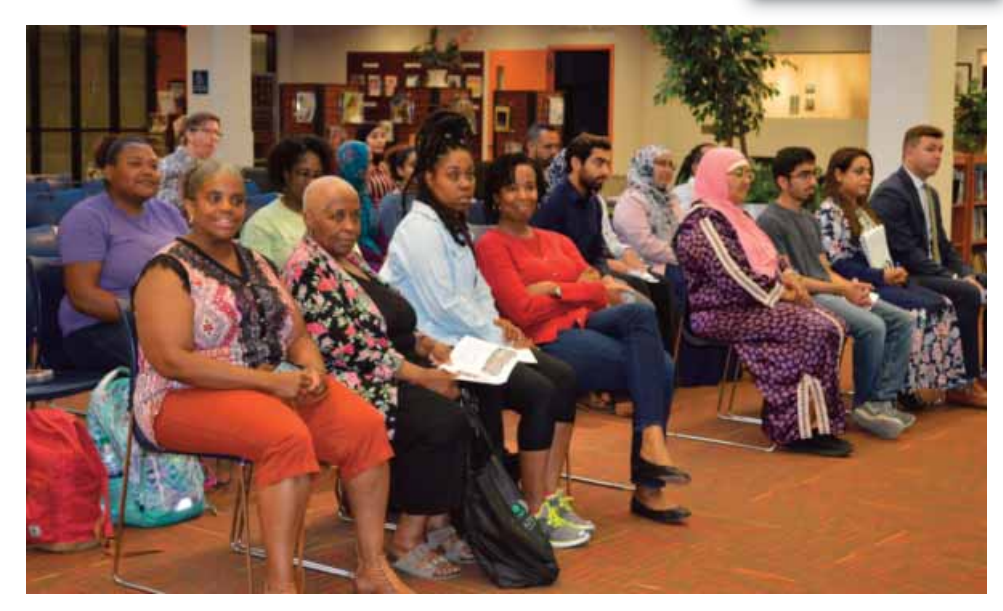
Art Exhibit - "Stories Never Told"