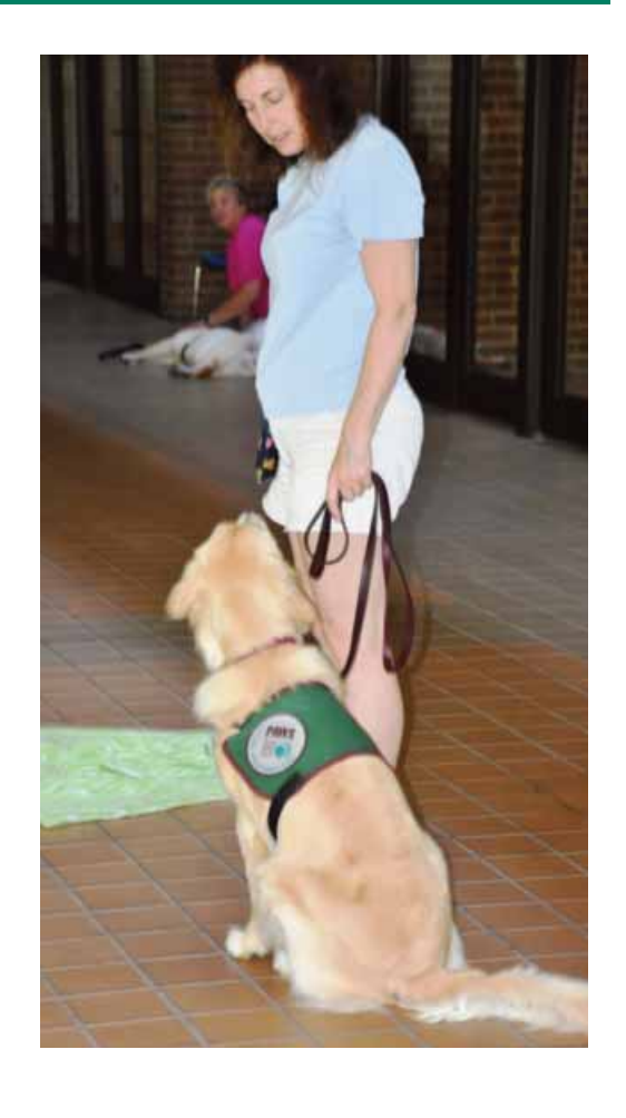
The Ted Scott hosted the PAWS with a CAUSE – Puppy Obedience Training Workshop.