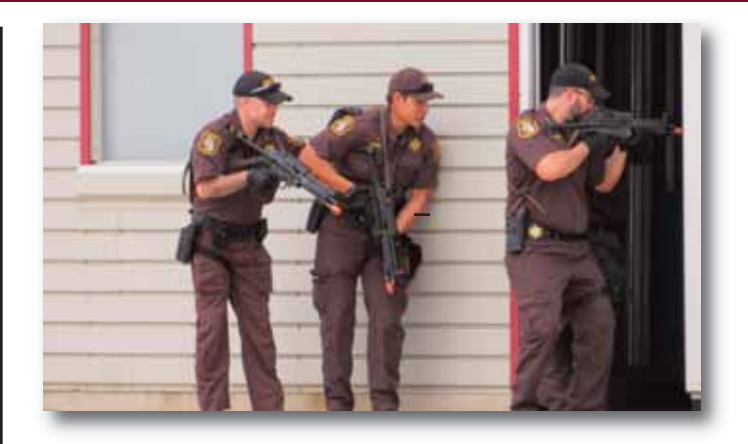
Wayne County Sheriff (WCS) – Special Response Team (SRT) Training