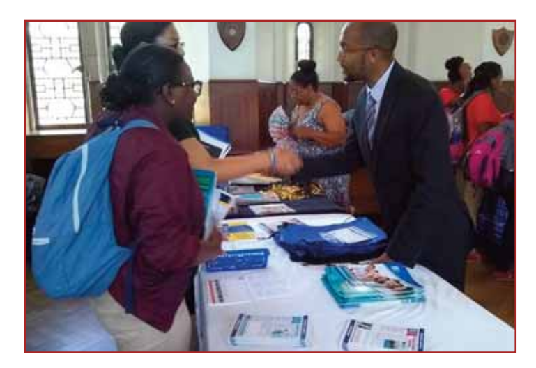
Cranbrook Schools TRIO-Upward Bound Program