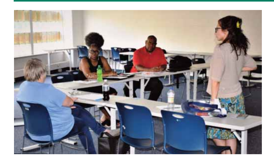
The Ted Scott campus hosted the Community Coalition Brainstorm Session Part 1 workshop.