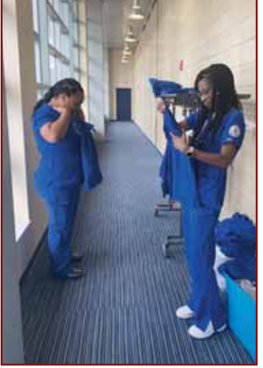
WCCCD's Student Nurse Association was on hand to assist with orientation.