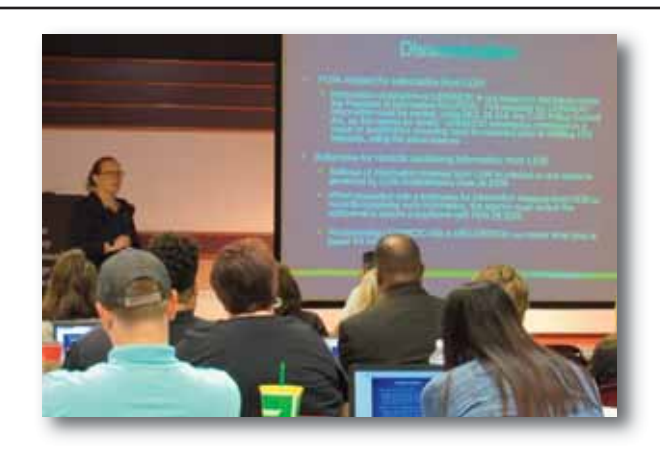
MSP Basic LEIN Operator Training for Law Enforcement