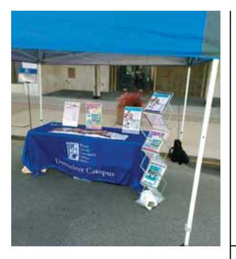
The Downriver Campus participated in the Wyandotte Street Fair.