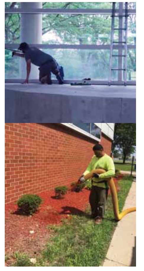
Eastern Campus facilities team hard at work.