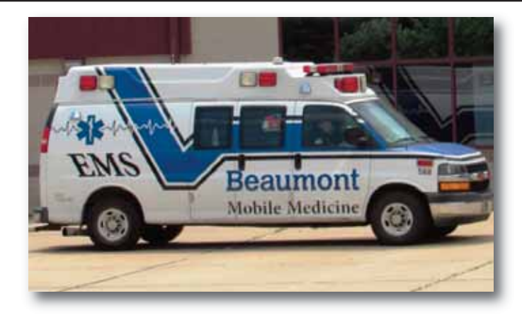
Emergency Vehicle Operations