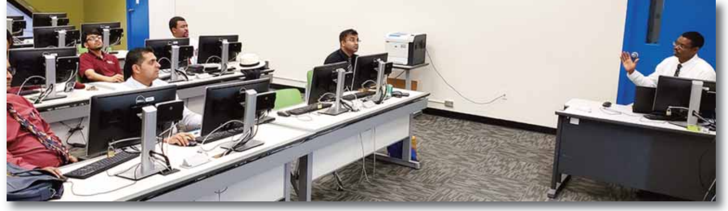
The Campus Support Team met for the third installment of VDI technical support training.