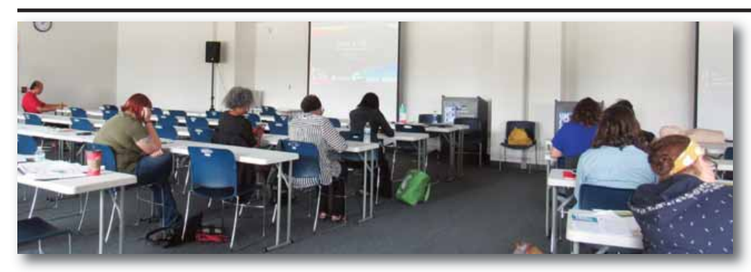
Detroit Wayne Mental Health Authority Children's Mental Health Grand Rounds