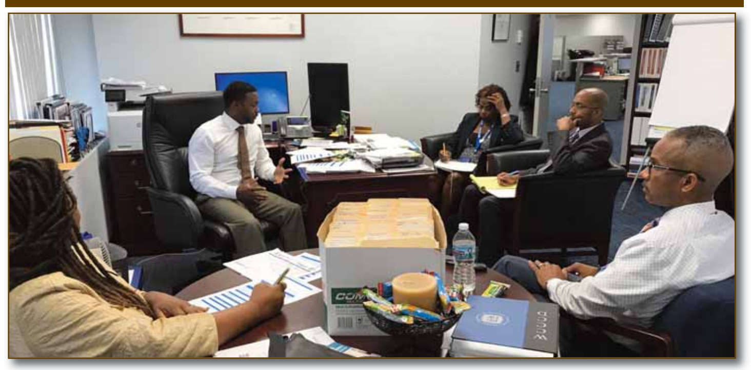
The Recuitment and Outreach Team met to discuss the schools that have contacted the District in preparation for Fall 2019.