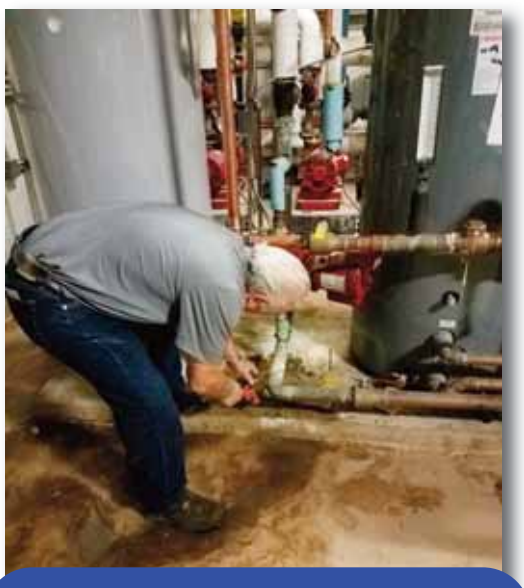
Downriver Campus Equipment Repair