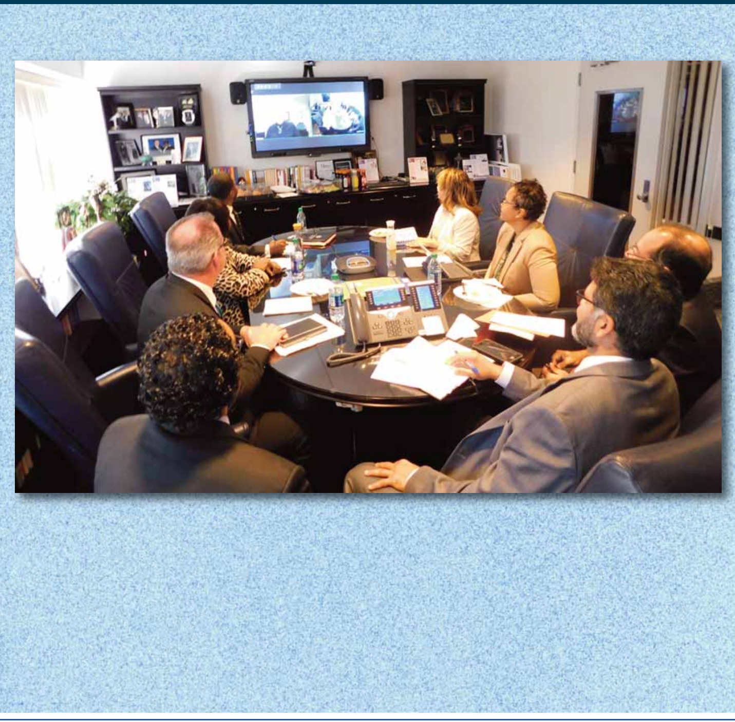
One Vision, One District, One College