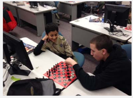
Boys Scouts of America Mahican District