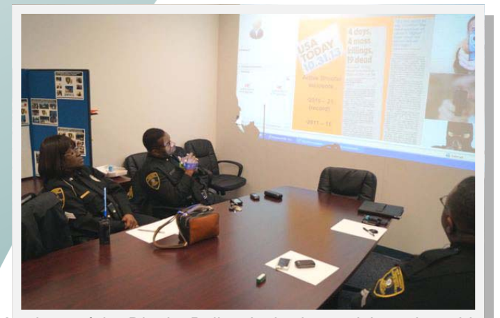
Members of the District Police Authority participate in webinar

Members of the District Police Authority participated in a Active Shooter: Best Practice in Table-Top Exercises webinar. This webinar taught the participants essential best practices to employ in writing, preparing, facilitating, participating, observing or critiquing table-top exercises.