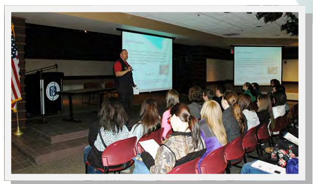
IRS- Investigating Cases Workshop

The Wayne County Sheriff's Training Unit attended a Pressure Point Control Tactics and Spontaneous Instructor Knife Defense workshop. They also attended an "IRS-Investigating Cases" training for high school students. Students were able to experience and observe investigation and integration techniques used by the IRS.