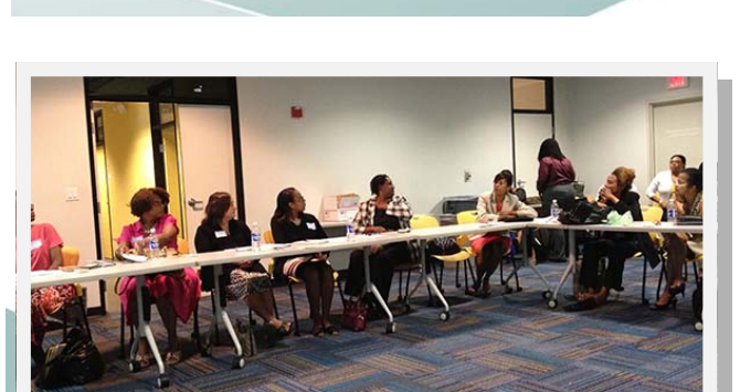
ON THE MOVE...

Instructional staff at the Western Campus held their annual faculty salutations for the Fall 2013 semester. Instructor's learned how to navigate features on the new WCCCD website, meet members of the administrative staff and learn about available services. Feedback indicated that faculty appreciated the professional development and engagement opportunity.