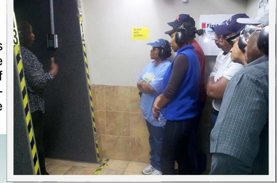
Basic Firearms Qualification Training