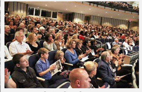
Sold Out Show!