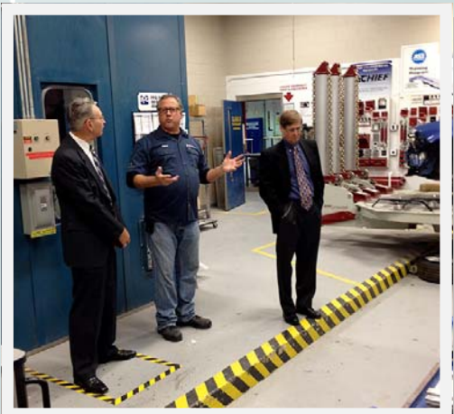
Best Practice Visit to Washtenaw Community College