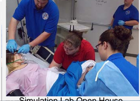
Simulation Lab Open House