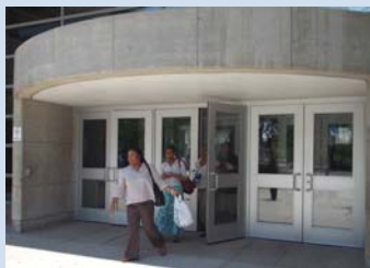
EVACUATION DRILLS AT THE DOWNRIVER CAMPUS