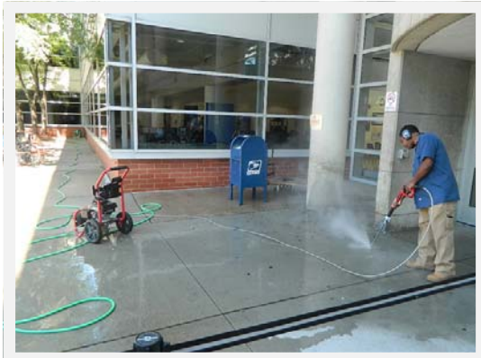
Concrete/Sidewalk Power Wash

In preparation for the Fall semester, a variety of maintenance and repair projects were completed by the Eastern Campus Facilities Team.