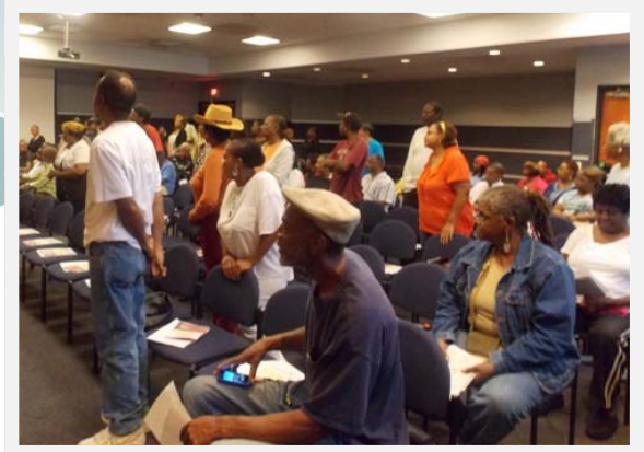
Mature Worker's Training

The Urban League of Detroit held their quarterly Mature Worker's Training on Job Readiness titled "A New Attitude...For a New Program Year!" The workshop focused on the challenge of a new attitude which included a presentation from the Hannah Foundation on lifelong learning. Presenters developed an individual employment plan and reviewed payroll information.