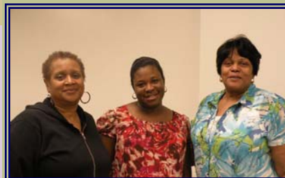
Members of the Northwest Campus Book Club

The Northwest Campus Book Club met to discuss “Perfect Peace” by Daniel Black. There was an in-depth conversation. The next book will be available to read next week, “Olive Kitteridge” by Elizabeth Strout.