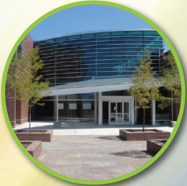
Ted Scott Campus